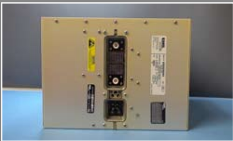
Rear interface port connector inserts.