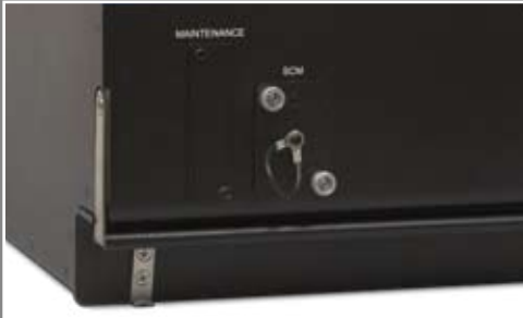
A quick-access port at the front of the unit for maintenance and control interfaces.