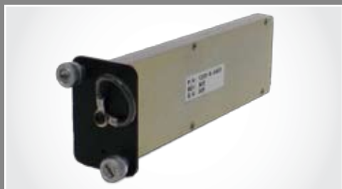
A removable SIM module allows quick activation and replacement.